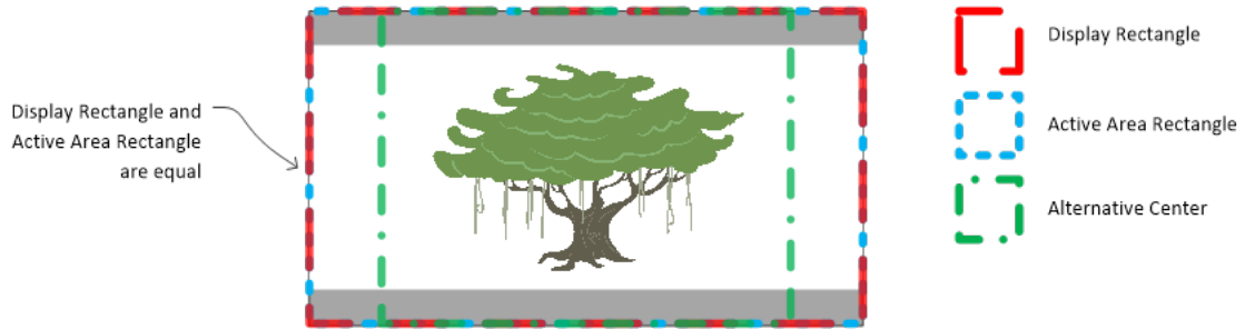
(a) Alternate 4:3 Center in the 16:9 Source Image which includes black bars

The process by which the dimension of the active area is set depends on individual workflows and can include a combination of manual and automated processing, during and after ingest.