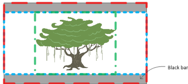
(b) Alternate 4:3 Center in >16:9 Active Area in the 16:9 Source Image